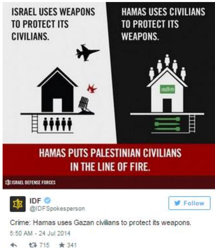
Figure 8. Israeli Defense Forces original tweet ( http://t.co/by2QzFI09d ).

During the Israeli– Hamas confrontation, both sides relied heavily on counternarrative strategies. Next to tweets telling their story, most of the tweets focused on refuting the legitimacy of the other's story. The escalation of counternarratives produced an interesting co-creational dynamic between the two sides. Because the IDF appeared to be more sophisticated and prolific in developing graphics, al-Qassam started appropriating IDF graphics. Figures 8 and 9 depict an original IDF tweet that al-Qassam reappropriated in its counterattack.