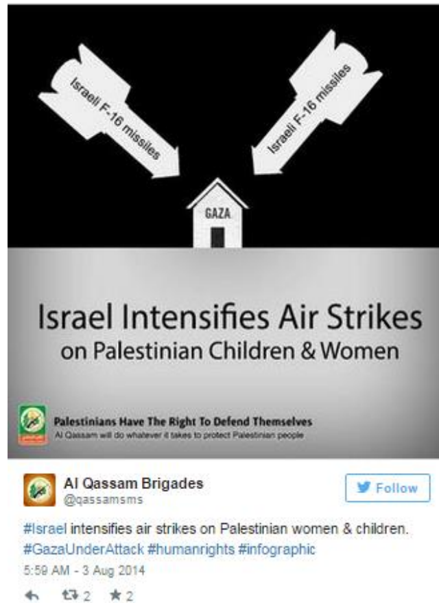
Figure 4. Al-Qassam victim.