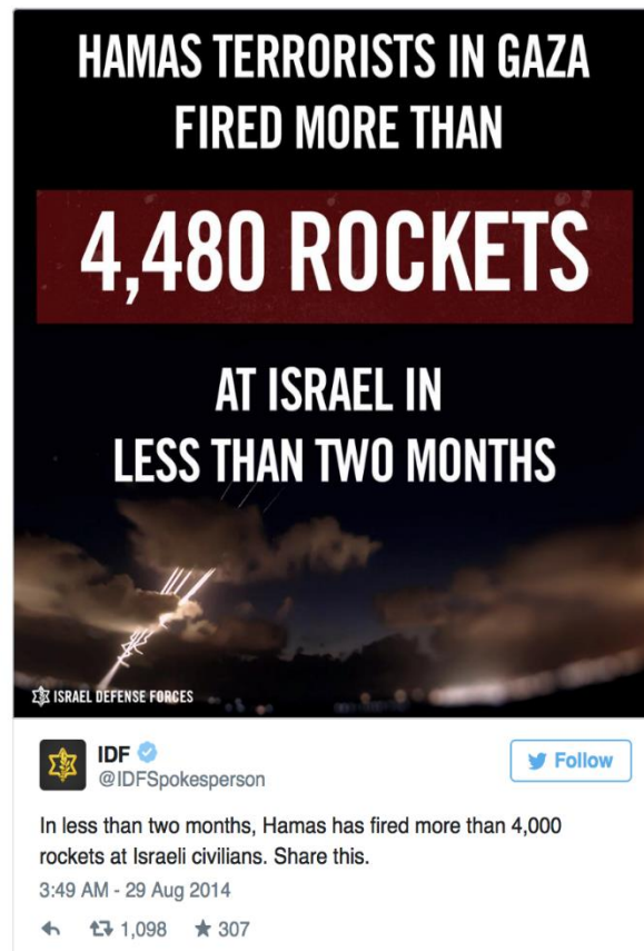
Figure 5. Israeli Defense Forces victim ( http://t.co/fBkqnVyVrs [tweet]).

As the narrative battle continues, the narrative trajectory of identity resilience reveals how the intensified efforts can cause mirror images to grow more frequent and proliferate to other dimensions, including powerful emotional ones. The emotional mirrors of fear and sadness are evident in the tweets about the Palestinian (see Figure 6) and Israeli (see Figure 7) civilian populations.