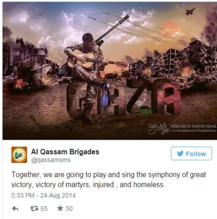
Figure 12. Al-Qassam victory ( http://t.co/Ig9z3Ri6wS ).

The Israeli side also claimed victory. Israeli Prime Minister Benjamin Netanyahu told a press conference that Israel had secured a "great military and political" achievement in the Gaza war and that Hamas had been dealt a "heavy blow" (Ravid, 2014, para. 1). On the diplomatic front, the prime minister said that Hamas had been isolated internationally, while Israel had "received international legitimization from the global community" (Israel Ministry of Foreign Affairs, 2014). The IDF tweet (see Figure 13) captures the Israeli victory narrative as relayed through a strong image and compelling statistics.