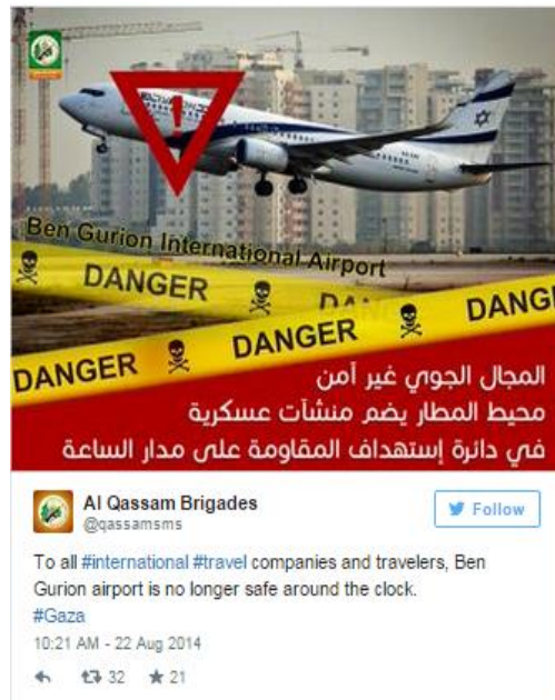
Figure 11. Al-Qassam defiance ( http://t.co/k2eWEvOAL2 [tweet]).

Again, unlike the military battlefield, it appears that relative size or power of the actor in the international arena does not necessarily determine who "wins." Despite the power difference between Israel, with the fifth largest military in the world, and the relatively weaker al-Qassam Brigades, one sees defiance in the narrative arch in an al-Qassam tweet (see Figure 11) threatening the safety of the Israeli airport.