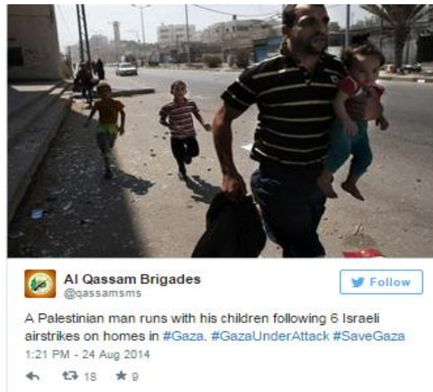
Figure 6. Al-Qassam emotional mirror ( http://t.co/z5f76OIPs6 [tweet]).