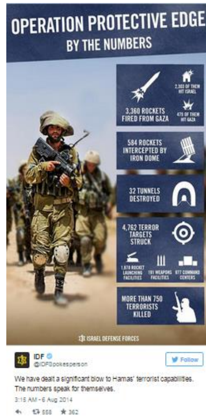
Figure 13. Israeli Defense Forces victory ( http://t.co/hgWGgVRRko ).

Thus, a final narrative paradox of identity resilience is that, unlike the decisive victory on the military or political battlefield, everyone can claim victory on the narrative battlefield.