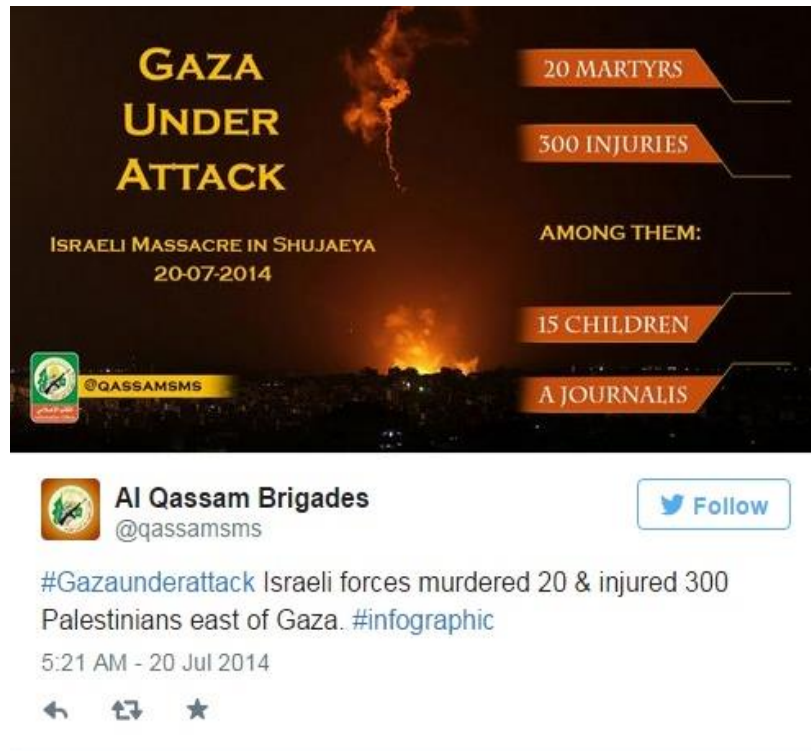
Figure 1. Al-Qassam identity expression ( http://t.co/cfpjQICuQU [tweet]).

The Israeli Defense Forces (IDF) self-expression was also evident on Twitter. Its Twitter feed was recognizable for its "sharp messages and catchy patterns" (Makuch, 2014) that were "clearly designed to get public opinion on Israel's side" (Gewirtz, 2014). The illustrative IDF tweet (see Figure 2), on Hamas rockets, incorporates high production graphics from intelligence units. Intentions, another aspect of self-expression, were also misconstrued.