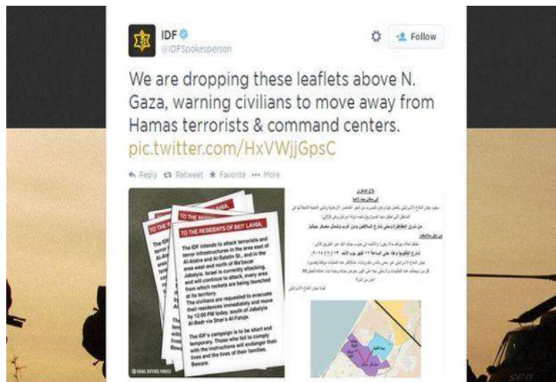
Figure 3. Israeli Defense Forces identity expression ( http://t.co/HxVWjjGpsC [tweet]).

These examples illustrate the first unexpected narrative outcome of how an actor's lack of awareness of its characteristic self-expression can have the unintended effect of creating misunderstandings and negative misperceptions.