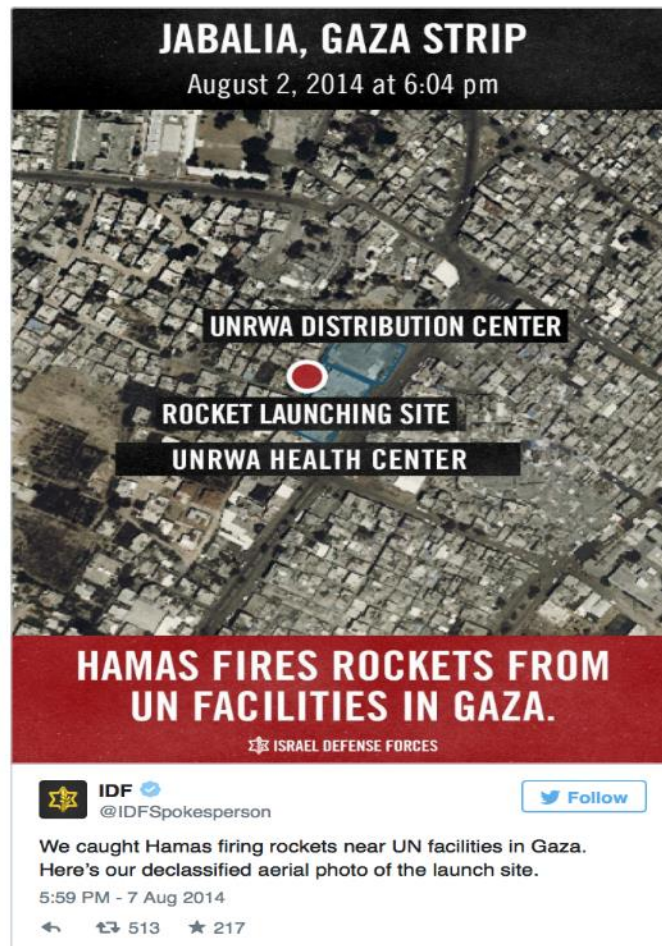
Figure 2. Israeli Defense Forces identity expression ( http://t.co/prjAmoQyJ9 [tweet]).

The IDF tweet (see Figure 3) suggests Israel's humanitarian intent by warning Gazans of impending strikes. However, with nowhere to flee, the prominent U.S. late-night commentator Jon Stewart made jest of the tweet by asking "Evacuate to where? Have you [expletive] seen Gaza?" ("The Daily Show's Jon Stewart brilliantly covers," 2014). Early on in the battle, both sides exhibited recognizable stylistic and idiosyncratic features as narrators.