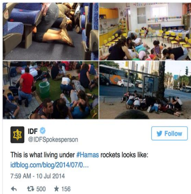
Figure 7. Israeli Defense Forces emotional mirror ( http://t.co/EdVt9IfzJk [tweet]).