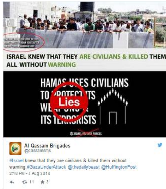
Figure 9. Al-Qassam appropriated tweet ( http://t.co/Xe19Uni742 ).

On the military battlefield, sustained physical attacks by one side often lead to the physical elimination of the other side. On the narrative battlefield, attacks often serve as triggers for identity resilience that prompt the actor to become more assertive in identity self-expression and self-preservation. The result of the dueling identity resilience can produce another narrative paradox: Rather than one side defeating the other, repeated attacks and counterattacks can cause the two sides to become more entrenched, with the mirror images producing a polarizing effect. Identity resilience helps sustain the polarizing effect of the cycle of counternarratives. The polarization on the Twitter battlefield was captured by Gilad Lotan (2014) in Figure 10. The “pro-Israeli” camp in blue is on the left, and the “pro-Palestinian” camp in green is on the right.